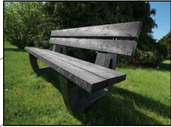
Fixed Recycled plastic bench